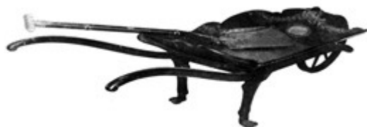
The rosewood wheelbarrow and the silver shovel that turned the Brazilian Emperor into a sweaty workman

Figure 3 shows the wheelbarrow used by the Emperor in the commencement ceremony for the construction of the Mauá railroad, officially called Imperial Steam Navigation Company and Petropolis Railroad, first railroad in Brazil. Figure 4 shows the opening of the railway on April 30, 1854, the first linking the Port of Mauá to Raiz da Serra, a stretch of 14.5 km. It was later extended to reach 15.19 km, also built by the Baron of Mauá ( http://acordamage.blogspot.com.br ).