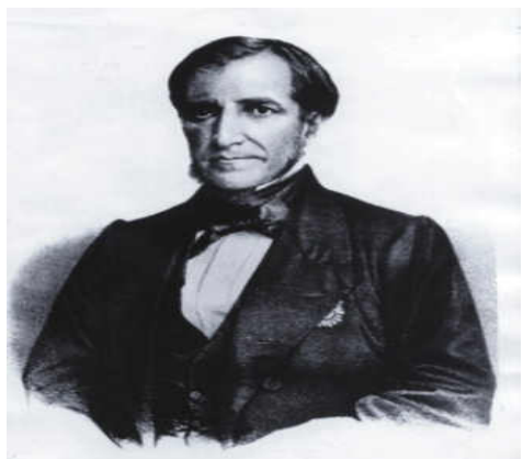
Figure 2: Irineu Evangelista de Sousa, Baron of Mauá