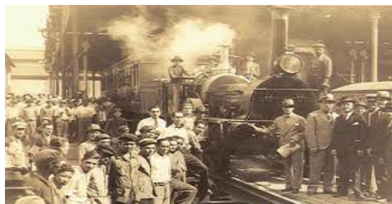
Figure 4 - Railroad Opening.